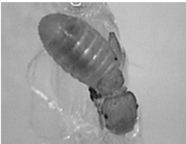
FIGURE 1. The psocid, Liposcelis bostrychophila Badonnel (Psocoptera: Liposcelidae) recovered from the insect box in entomology museum, IMR. (x40)

Liposcelis bostrychophila is an extremely difficult insect to control. Its small size enables it to hide in crevices